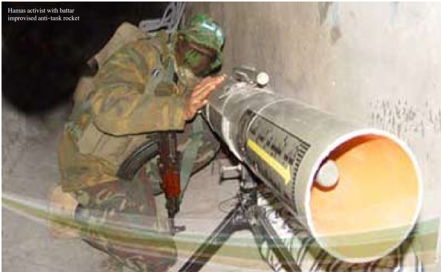
Hamas activist with battar improvised anti-tank rocket