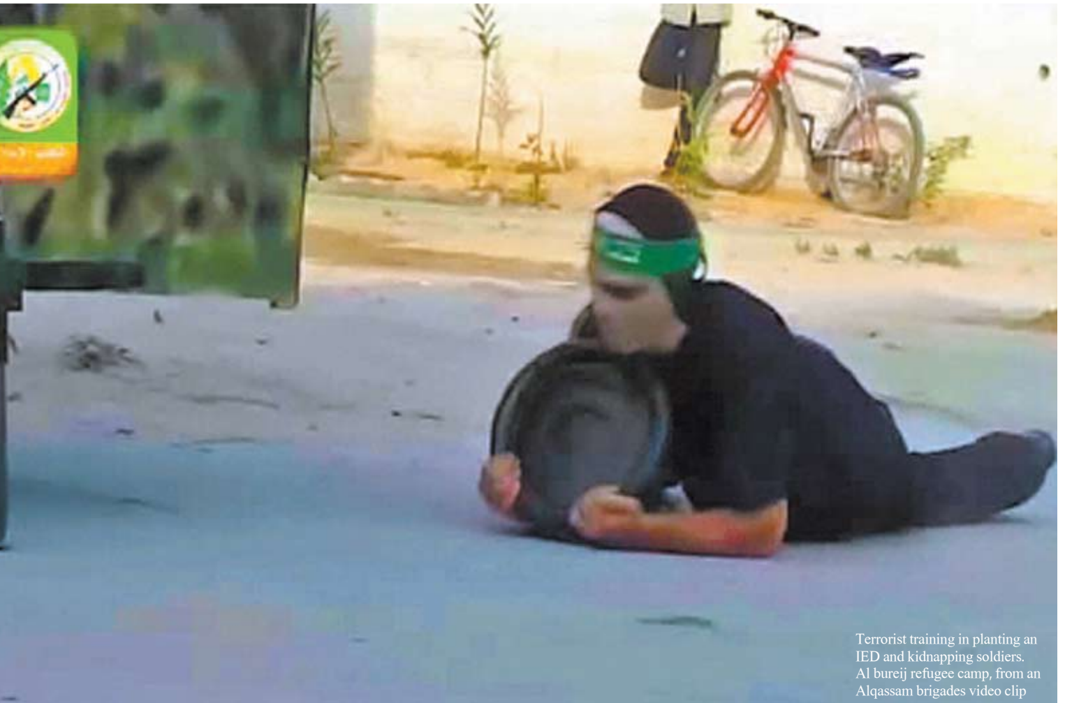
Terrorist training in planting an IED and kidnapping soldiers. Al Bureij refugee camp, from an Alqassam brigades video clip

the company's unique systems, and others.