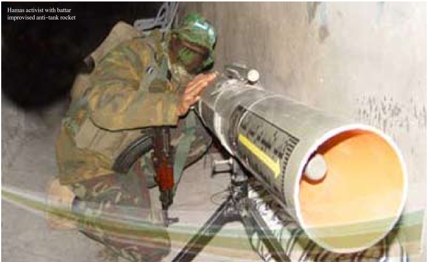
Hamas activist with battar improvised anti-tank rocket