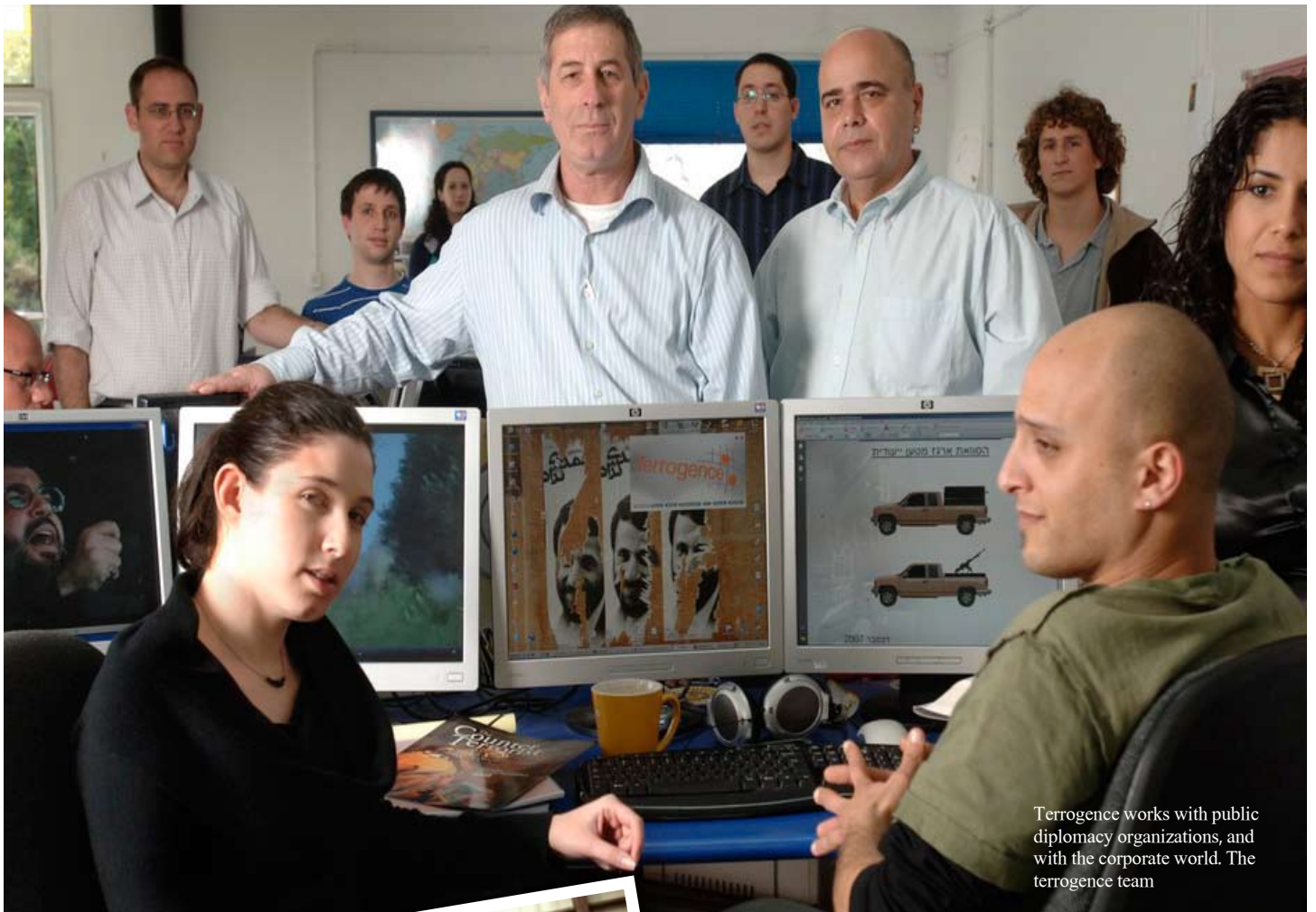
Terrorence works with public diplomacy organizations, and with the corporate world. The terrorence team